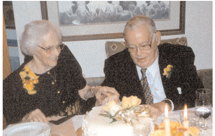
Mom and Dad celebrating 60 years of wedded bliss.

When we moved to a small town with no church choir, Dad volunteered to direct and did a great job. The choir did so well, the church decided to hire a paid director; he cheerfully joined the bass section. He was often called upon to sing solos; one of his favorites was “O Rest in the Lord,” from Mendelssohn’s Elijah .